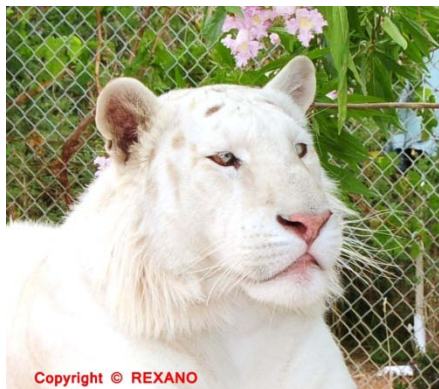
SNOW WHITE TIGER: white with very faint stripes, blue eyes